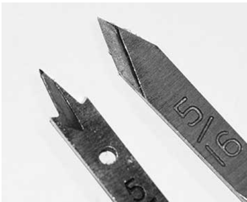
These types of spade bits are okay.

WARNING: Our Farkle Shelf is "bounce free" when mounted properly. However, mounting heavy gadgets beyond the back edge of the shelf can potentially cause the shelf and windshield to bounce on rough roads.